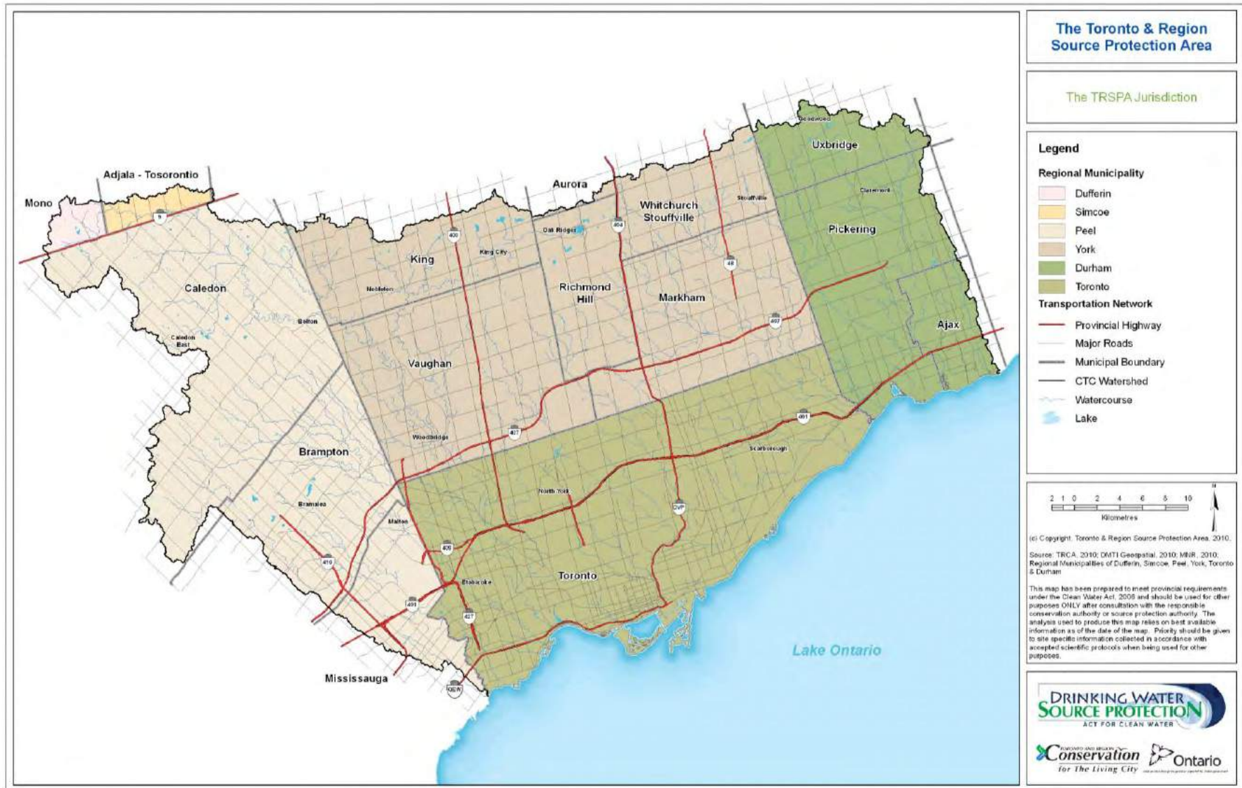
Figure 1.3: The Toronto and Region Source Protection Area Jurisdiction